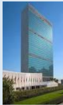
UNITED NATIONS Land Assemblage