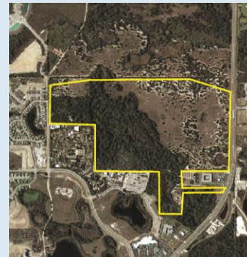
CHINA OWNED CHINA TRAVEL SERVICES, FORMER SPLENDID CHINA THEME PARK Land disposition