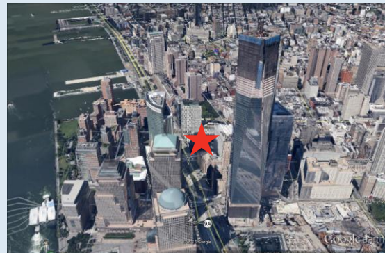
101 MURRAY ST, TRIBECA, MANHATTAN 31,028 SF site, land disposition for St. John's University.