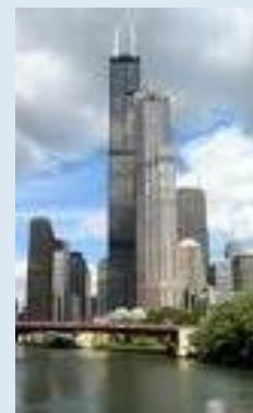
SEARS TOWER Land Assemblage